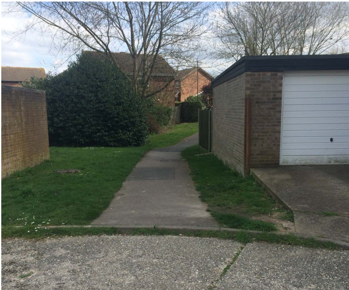
Figure 4: View from Drake Close towards Foxglove Close