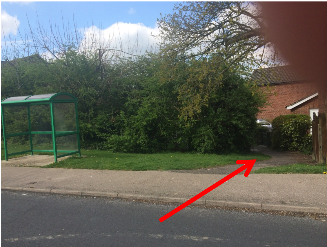
Figure 1: View from Jackdaw Lane towards Brook Road

Figures 1 & 2 below show where the new 10m cycle path could be created. This would require the removal of some bushes (on public land), a shared-use path (5m width) and suitable access points (barrier free with dropped kerbs and smooth turns) on to the roads at each end.