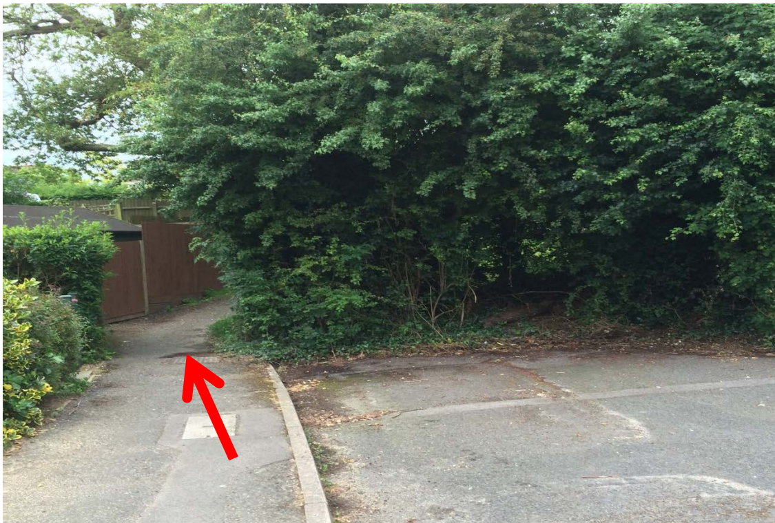
Figure 2: View from Brook Road towards Jackdaw Lane