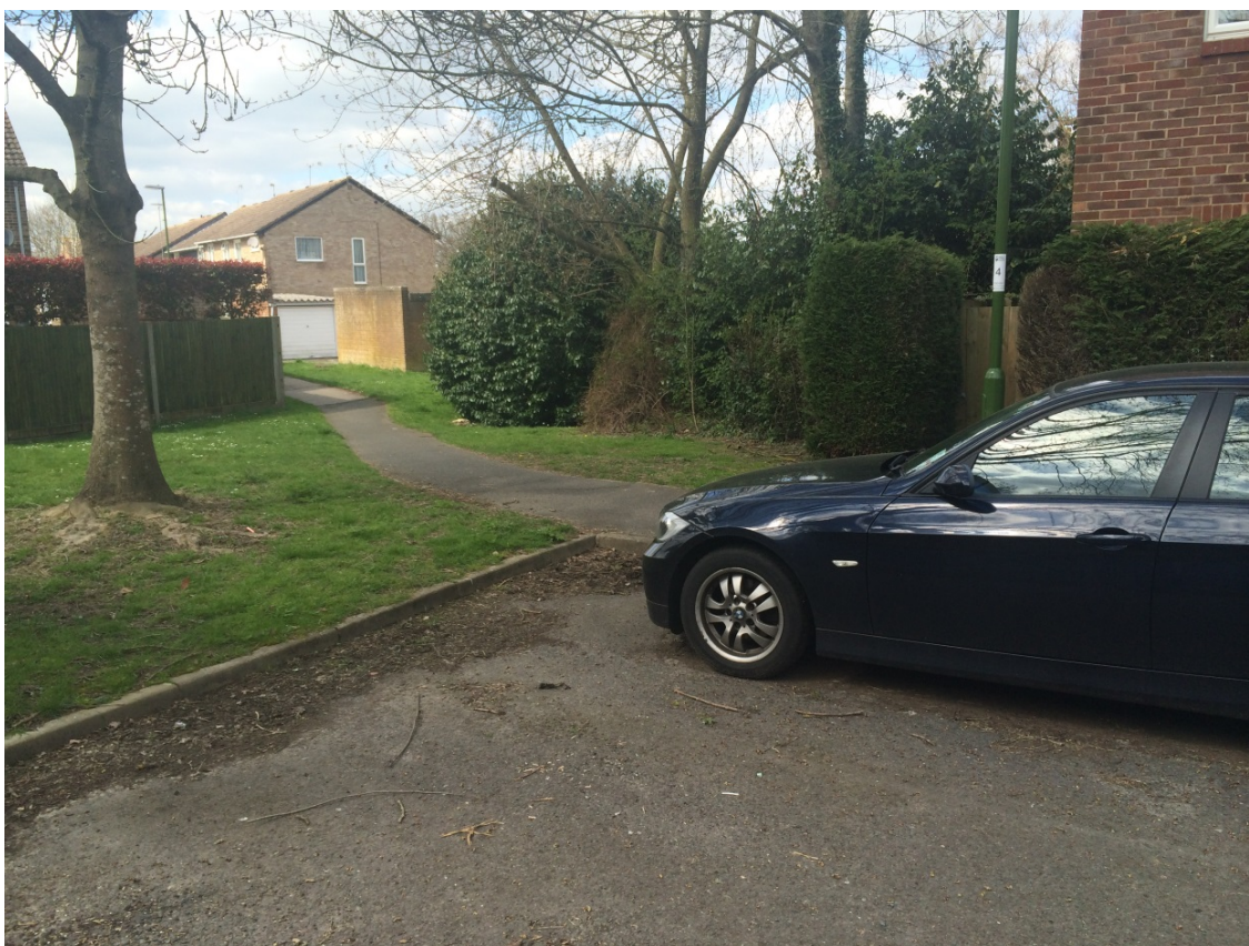
Figure 3: View from Foxglove Avenue towards Drake Close

Widening of the footpath shown in Figure 3 is needed, plus new dropped kerbs at either end. The access point from Foxglove Avenue should be in front of the blue car since otherwise there is a blind corner on the footpath. A further dropped kerb is needed at Drake Close (Figure 4).