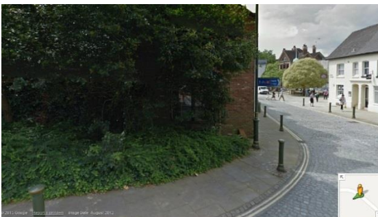
Potential site for additional cycle parking next to Waitrose