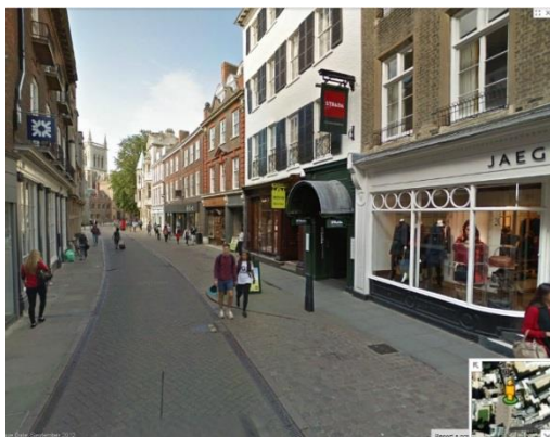
Example of cycle access in a pedestrian zone (Trinity St, Cambridge)

Much-needed additional cycle parking could be provided near the existing fountain.