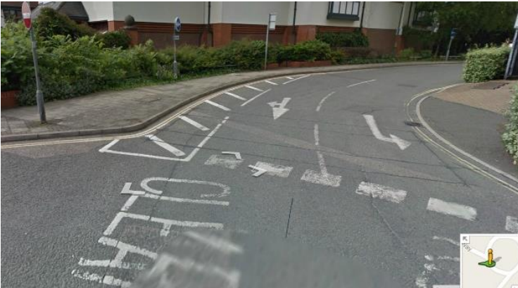
Space for contraflow cycle lane in Copnall Way

This will provide cycle access to the Carfax from the east of the town.