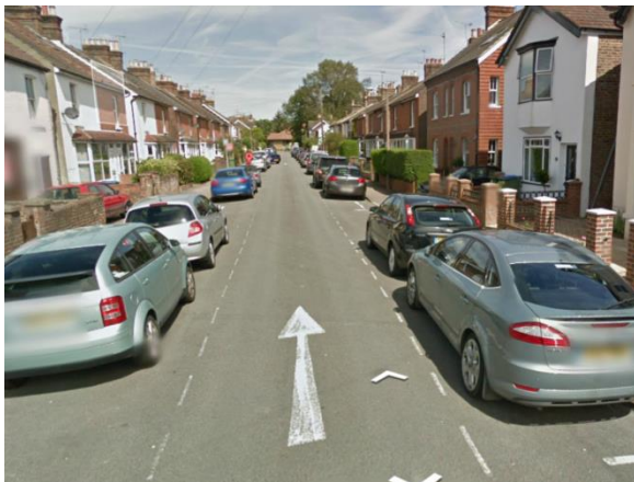
Barrington Rd: contraflow cycling here would link up to an existing cycle route