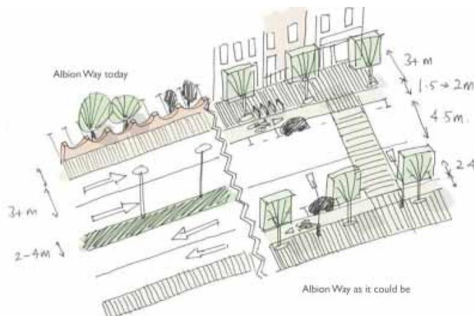
Horsham Town Plan shows how a cycle track can pass behind parked cars