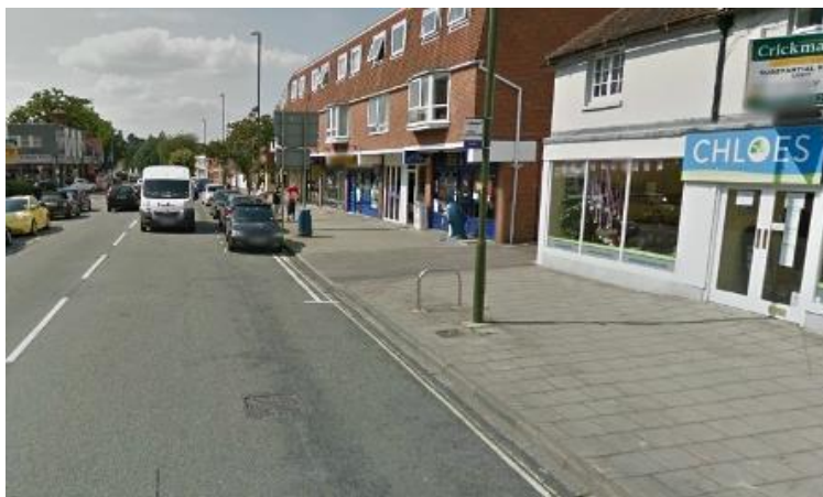
Room for eastbound cycle track behind parked cars in Bishopric