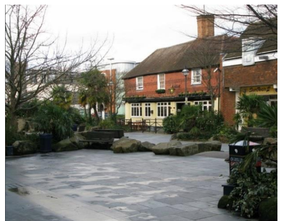
View of Bishopric pedestrianised area