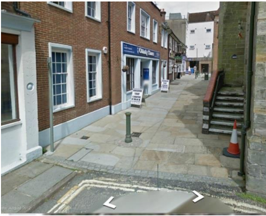
Route past the old Town Hall – previously open to motorised vehicles