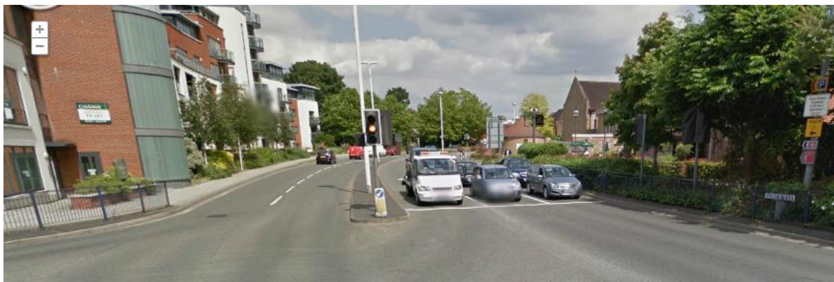
Location for cycle crossing between Bishopric (left) and the pedestrianised area (right)

There is space for a crossing on the northern arm of Albion Way. The cycle path could go behind the existing waterfall, allowing this attractive feature to be retained together with much of the screening.