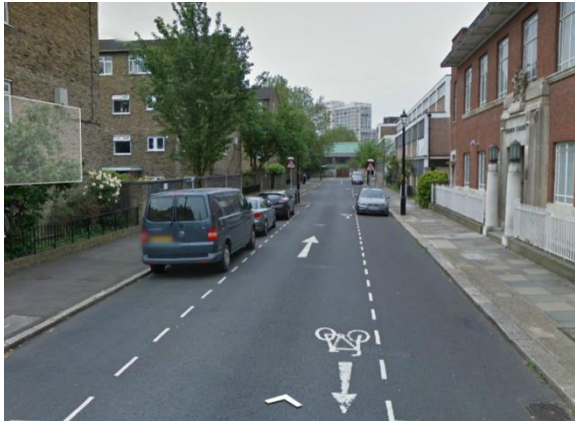
Swan St, Bermondsey: an example of contraflow cycling along a single lane road between two rows of parked cars

Outside of the immediate town centre, Barrington Road would be another very useful road for two-way cycling, allowing cyclists from north of the town speedy access towards the station and the town centre. The northern end of the road would then link up with the cycle path at Booth Way. Although the road is narrow there is a very low traffic flow, and speeds are very low, reducing possible conflicts.