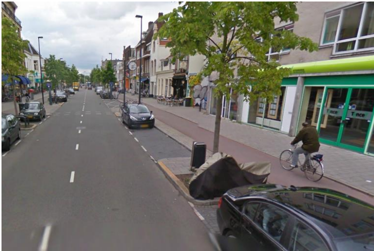
Example of cycle track passing behind parked cars (Biltstraat, Utrecht)

Eastbound, there is space for a cycle track behind the parked cars. It should have priority over the driveways.