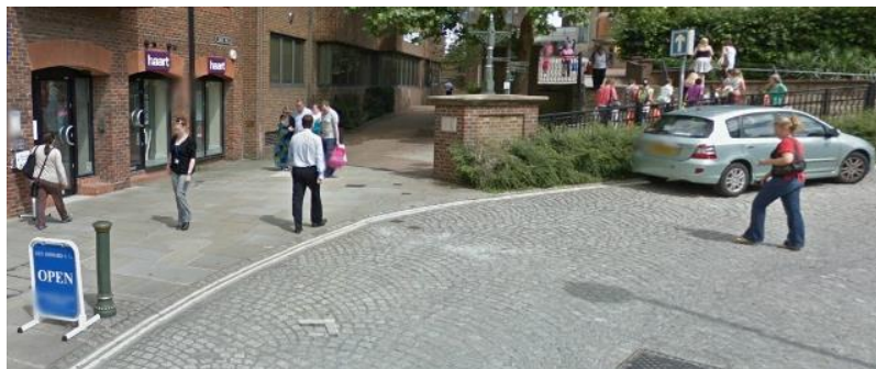
Chart Way bridleway needs to be linked to Carfax / Chart Way